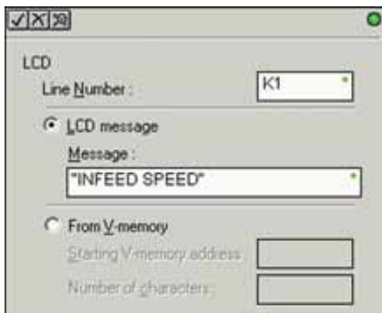
Simple text message