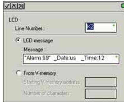
Message with embedded date and time

The LCD instruction in DirectSOFT gives the PLC programmer a convenient way to define screen messages. A literal string can be programmed using the LCD instruction. Embedding variables allows you to customize the messages for an application that involves changing values. The following example shows an embedded date and time on an alarm message: