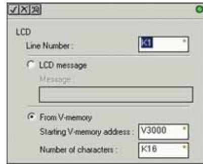
Message from PLC memory

Up to 16 characters of ASCII text can be displayed per line. In the example, K16 indicates that 16 bytes (8 words) of ASCII text is retrieved for display.