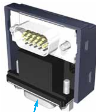
DL06 15-pin high density D-sub port adapter D0-06ADPTR